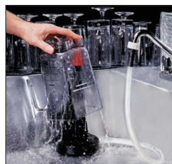
Rinse-o-matic in action.